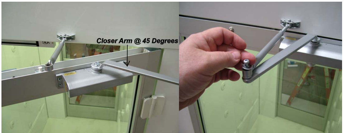
MANUAL DOOR CLOSER

Step 14: Check the air shower for proper sequence.